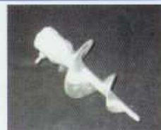
Cast Aluminum Auger