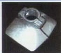
Cast Aluminum Dock Pad