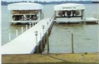
Our White See Through Sectional Dock