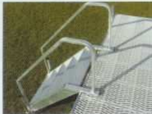
Close up view of deck with a 5 step Craftlander stair. 4, 5, 6 steps available.