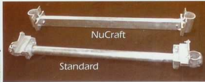
Patented NuCraft Crossarm - top.

Easier to adjust, won't crack or slip. More stable than standard cast clamps. "LIFETIME WARRANTY" on breakage due to normal use.