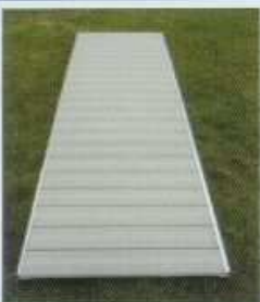
2', 3' and 4' wide available.