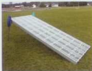
4'-0 wide available. 10' long.