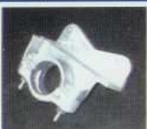
Cast Aluminum Stringer Bracket