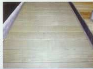
Premium grade Pine Decking