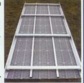
Bottom view showing construction

Plastic deck with wood, foam bumpers and a 5 step Craftlander stair.