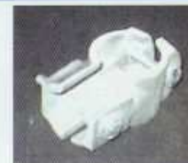
Cast Aluminum Crossarm Clamp