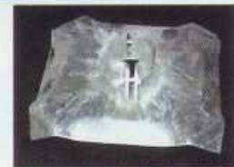
1/8" Aluminum 10" Square Pad