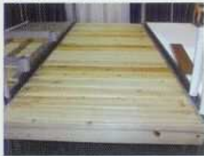
Cedar "Top Quality wood decking"

Our 10' long wood dock sections have 21 boards per section and are screwed together underneath. What does that mean? Smaller gaps between boards and less chance of boards coming apart. COMPARE! 2', 3' and 4' wide available. 10' long standard, 8' also available.